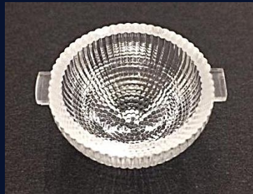
Shell mixer without lightguide